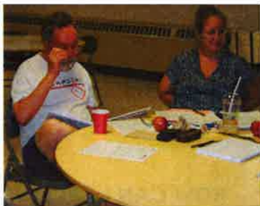
Williamsport, July 2011

Designed to introduce persons to the PA Campaign for Better Care, the trainings also provide fertile ground to involve persons in doing advocacy. Graduates of the LUYV trainings have joined committees; attended rallies; offered testimony; written and had published letters-to-the-editor; are in the process of being trained to be trainers; and have planned community outreach events.