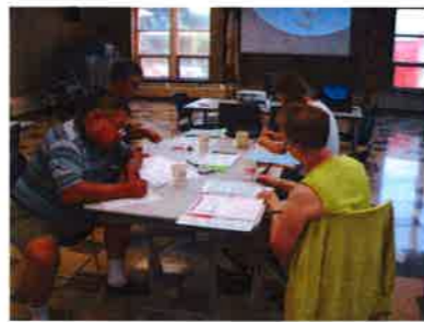
Wellsboro, July 2011

If you are interested in participating in a Lift Up Your Voice! advocacy training, or want to have the training offered to your group, congregation, team, etc. Please contact: